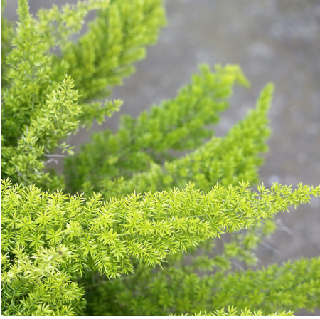
Asparagus Fern Unknow Plant Type: Perennial Water Use: Low