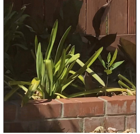
Amarillis Unknown Plant Type: Bulb Water Use: Medium