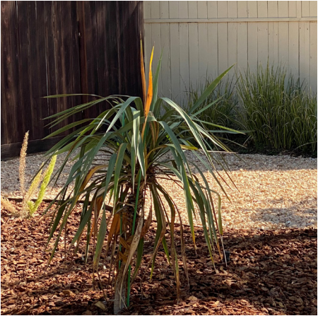
Yucca Unknow Plant Type: Succulent Water Use: Low