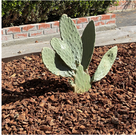
Prickly Pear Cactus Cactaceae Plant Type: Succulent Water Use: Low